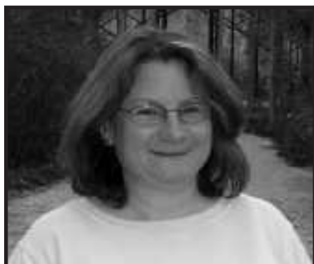
Photo permission of the Ozarks Regional Herbarium. ( http://biology.missouristate.edu/Herbarium ; Text: www.floridata.com )

Devil's walking stick was used for medicinal purposes by Native Americans and early settlers. The bark was administered as a purgative and the berries were employed in pain killing preparations. Various parts of the plant have been used to treat boils, fever, toothache, cholera, eye problems, skin conditions, and snakebite. Berries of Aralia spinosa are valuable as food for birds, black bears, and other wildlife.