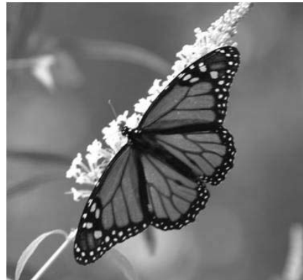
Monarch feeding on a Butterfly-Bush.