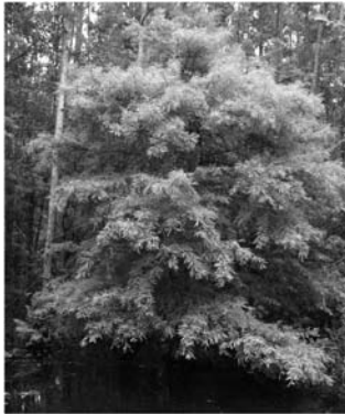
This beautiful bald cypress is found at the water's edge, south of the bridge at Cypress Cove. The adjacent pond cypress in this area provides an excellent opportunity on tours to discuss the differences between these two species.