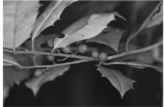
Drought tolerant American Holly (Ilex opaca) grows in shade or sun, and has berries favored by many species of birds. Great for "decking your halls" in the winter months!

Although there are many informative websites with good descriptions and photographs to help confirm the identification of a plant, most do not help identify the plant in question – the purpose of the website. By simply identifying the flower color, the user may browse thumbnail photographs of all plants meeting that criteria. One simply clicks the thumbnail resembling the specimen for specific information, including detailed photographs illustrating different plant parts from various views and angles. Some will show the different leaves of