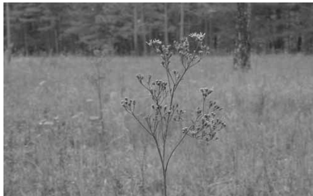
Carphephorus odoratissimus Vanilla-Plant

Have fun learning how to use Global Positioning Satellite (GPS) technology in real life settings at The Crosby Arboretum. A short training session will precede a scavenger hunt where you will use a GPS receiver to locate individual plants and plant communities. All ages are invited to participate so, bring the whole family! Weather permitting. Admission is free for arboretum members, $8 per family who are non-members. Call 601-799-2311 to register.