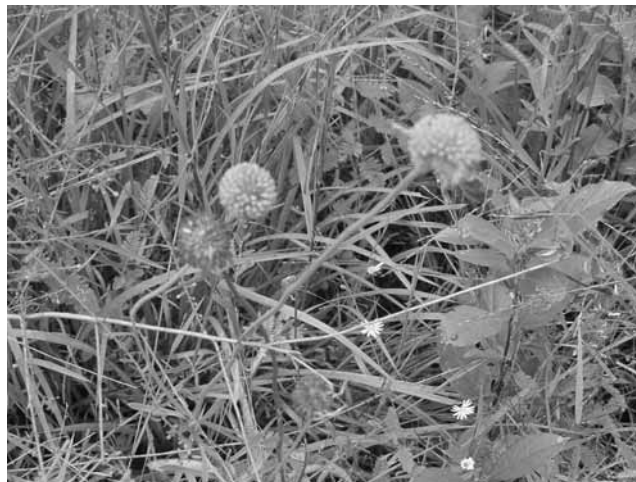
Balduina uniflora setting seed

This time of year the savanna is filled with several colorful composite flowers! Join us as we meander through the savanna identifying the various flowers in bloom this season. Weather permitting. Admission is free for members and $4 for non-members. Call (601) 799-2311 to register.