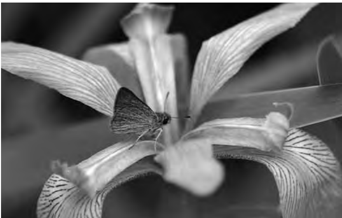
A skipper butterfly poses on the spring bloom of a Louisiana Iris in the Arboretum’s Aquatic Exhibit.