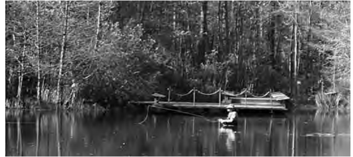
Will Sullivan volunteered again as a willing “pond ornament” and provided a fly fishing demonstration, to the delight of schoolchildren on Wildlife Day in March.