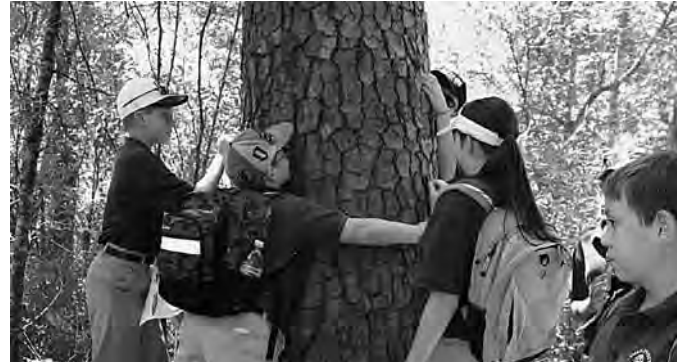
During their May field trip, fifth grade students from Lamar Christian School in Purvis give a big bug to the loblolly pine on the Pond Journey that survived Hurricane Camille.