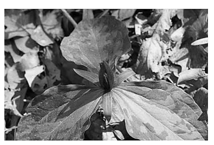
Mississippi River Wakerobin or Trillium foetidissimum.

In the past I have found trilliums in the state park in Natchez, along the southern portions of the trace, outside of Hattiesburg in Ragland Hills, near Tishomingo State Park and in a small secluded area of Jones County, but this year I missed finding any trilliums blooming here in