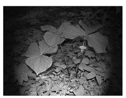
Nodding Trillium, Trillium flexipes.

TRILLIUM TALES (Continued from page 1) more brightly colored wildflowers. After we left the park, we continued northeastward on to New Hampshire by way of Blackwater Falls State Park in West Virginia, but we had overrun spring by that time and saw no more trillium until we returned south on our trip home.