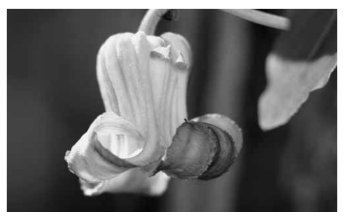
A Clematis crispa bloom found on the trunk of a pond cypress, in the Arboretum's Cypress Cove.

Visitors to the Arboretum's November Piney Woods Heritage Festival reported having great fun exploring the Pond and Savanna Journeys using the new Crosby Arboretum Nature Explorer application by GPTrex, Inc. The application offers an interactive, familyfriendly application for persons with iPhones, iPads or iPod Touches. Instructions for downloading and using the "app" are available in the Arboretum Gift Shop for persons with an Apple mobile device. The free pilot adventure provides "more to explore" for visitors of all ages with beautiful hi-resolution images of plants and animals, streaming video, GPS mapping, and challenge questions. There are nine stops, developed by MSU Professor Bob Brzuszek, that tie into the map on the app. Feedback is being collected, and a survey is located on the app's last stop. Upon completion of the survey, participants will be directed to come to the Visitor Center Gift Shop and receive a Crosby app certificate and a special prize! We are pleased to be able to offer this new method for our visitors, especially families, to explore and interact with the Crosby Arboretum.